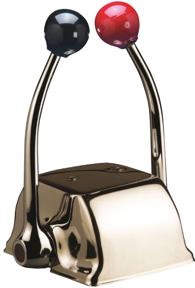
WITH POLISHED CHROME KNOBS