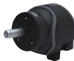
Sport Plus Tilt SH91900P