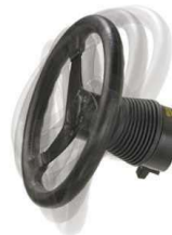
Tilt option available SH91800P